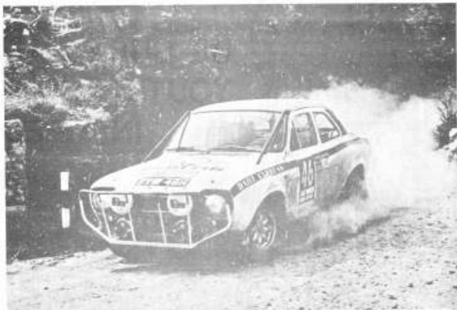
World Cup '70. The Winning Ford Escort was Cibie equipped.